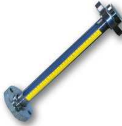
Pressure / Temperature Envelope